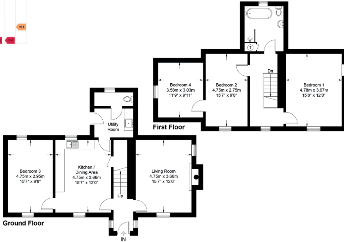
Illustration for identification purposes only, measurements are approximate, not to scale. Fourlabs.co © (ID1157243)