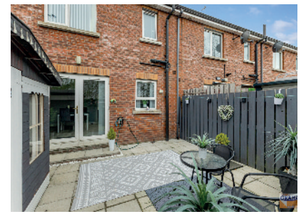
73 Causeway Meadows