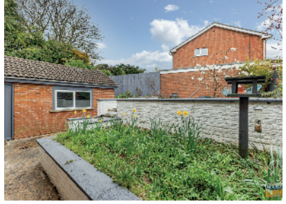
8 Pond Park Road