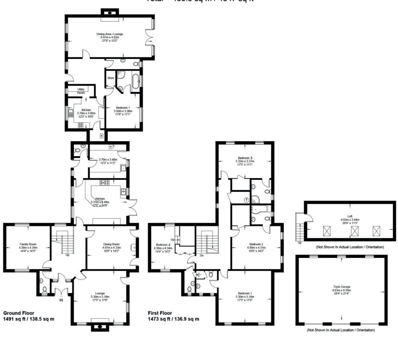
Illustration for identification purposes only, measurements are approximate, not to scale. FloorplansUsketch.com © 2023 (ID1011866)

Approximate Gross Internal Area = 275.4 sq m / 2964 sq ft Outbuildings = 86.2 sq m / 928 sq ft Annexe = 88.7 sq m / 955 sq ft Total = 450.3 sq m / 4847 sq ft